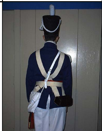
Sergeant back view