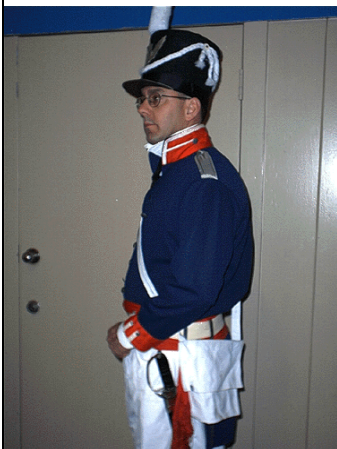
Officer side view

Thank you to the Scouts and Leaders from Troop 104 Kenmore, New York