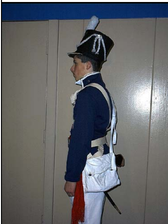
Sergeant side view