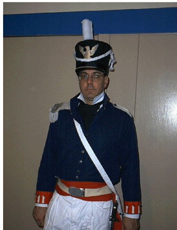
Officer front view