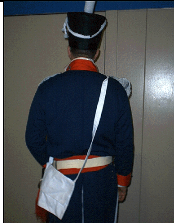
Officer back view