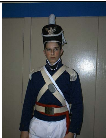
Sergeant front view